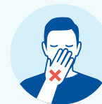
DON'T TOUCH EYES, NOSE OR MOUTH