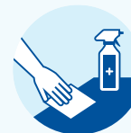
DISINFECT SURFACE AREAS