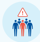
AVOID CROWDED AREAS